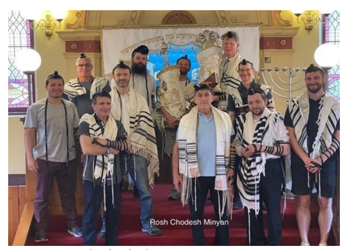
Rosh Chodesh Minyan at Newtown