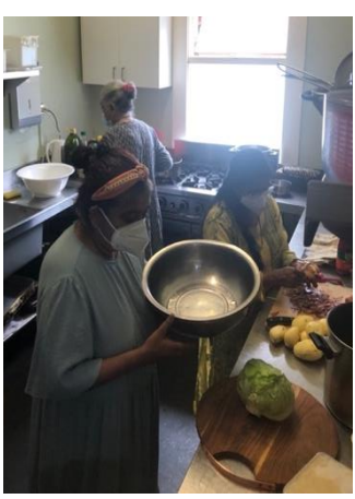
Preparing an Indian Shabbat Dinner