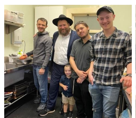
The all-male cooking crew