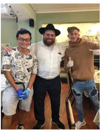
Men at work