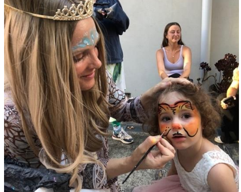
More Purim 2023