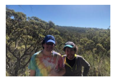
Young Adult Group on a Hike