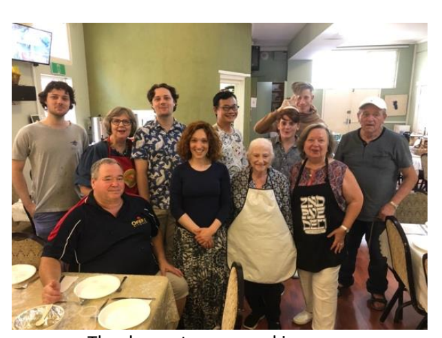
The dream team – cooking crew