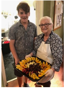
Cooking class for the younger generation