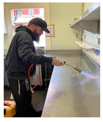
Kashering for Pesach